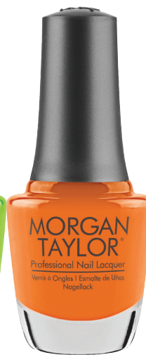
YOU'VE GOT TAN-GERINE LINES