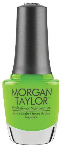
LIMÓNADE IN THE SHADE