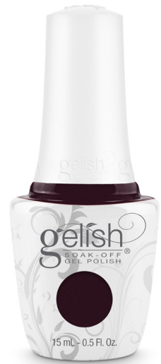
DANCED AND SANG-RIA

With BLACK SHADOW and the Mini Striper Brush, outline the rose. Cure for 30 seconds. Apply TOP IT OFF to the entire nail making sure to cap the free edge. Cure for 30 seconds. With NAIL SURFACE CLEANSE and WIPE IT OFF lint-free wipes, cleanse the inhibition layer of the nail. Finish your look by massaging NOURISH CUTICLE OIL into the skin surrounding the nail plate. Enjoy your finished look.