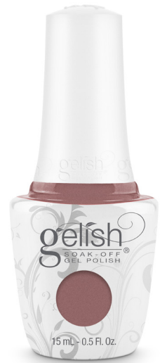
MAUVE YOUR FEET

Continue the pattern throughout the entire nail covering every part of the nail. Cure to 30 seconds. With Nail Surface Cleanse and Wipe It Off lint-free wipes, cleanse the inhibition layer of the nail. Finish your look by massaging NOURISH CUTICLE OIL into the skin surrounding the nail plate. Enjoy your finished look.