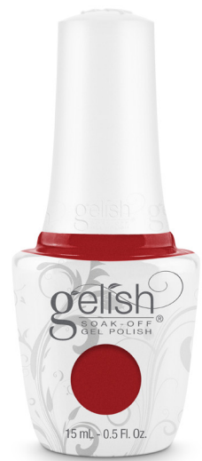
DON'T BREAK MY CORAZÓN

With BLACK SHADOW and the Mini Striper Brush, outline the roses. With Don't Break My Corazón and a DOTTING TOOL , place three dots onto the nail. Cure for 30 seconds. Apply TOP IT OFF to the entire nail making sure to cap the free edge. Cure for 30 seconds. With NAIL SURFACE CLEANSE and WIPE IT OFF lint-free wipes, cleanse the inhibition layer of the nail. Finish your look by massaging NOURISH CUTICLE OIL into the skin surrounding the nail plate. Enjoy your finished look.